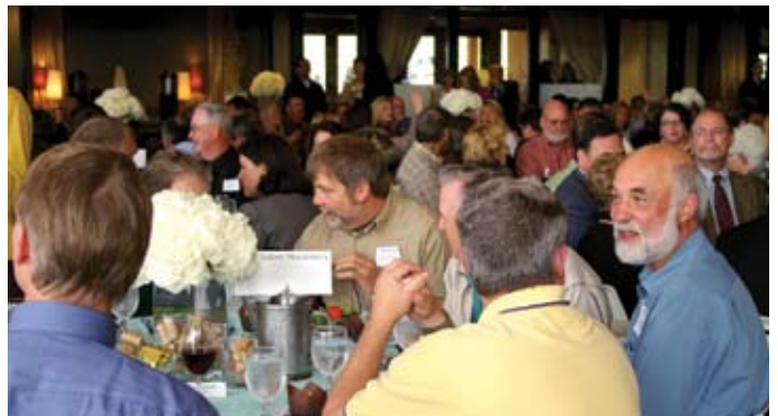
West Salem Machinery and other attendees enjoy the day.

Call 503-364-2213 or visit www.westsalem.com .