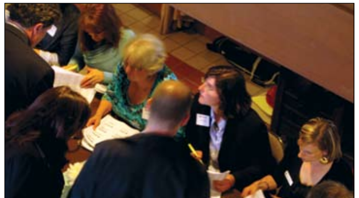
Thanks to all the volunteers who helped with registration and setup.